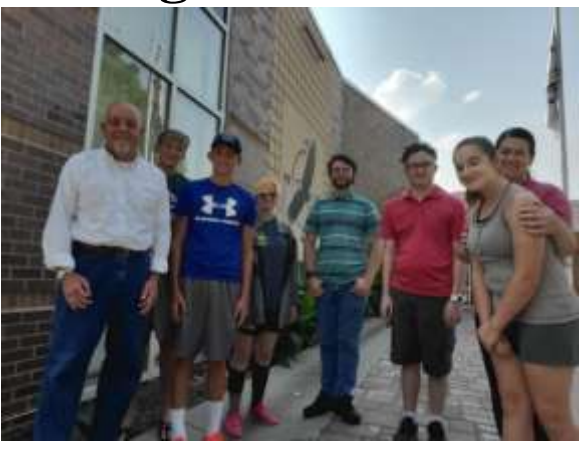
↑ Senior High trip to St. Joseph's Indian School, August 1<sup>st</sup>